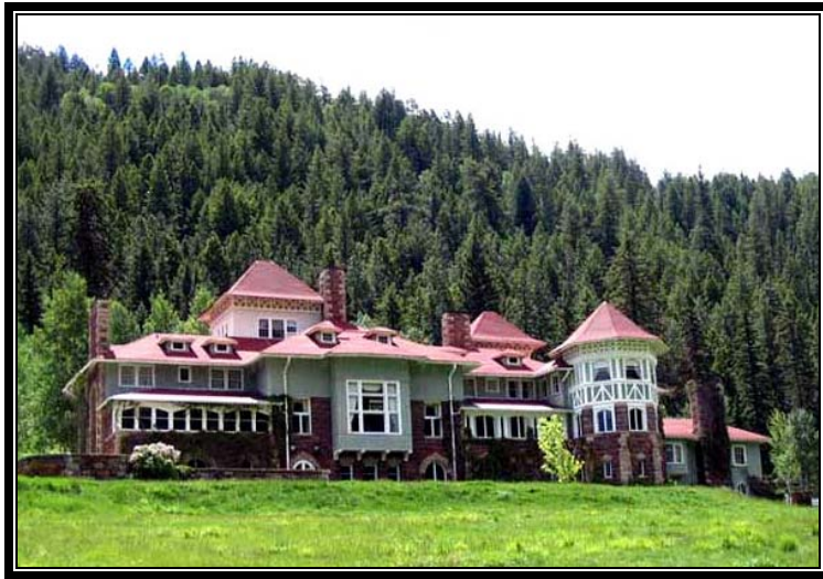
Historic Redstone Castle Tour (Humorous and Historic Tales of the Region)